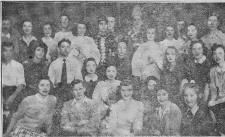
The group pictured above is a portion of the cast which will appear Saturday in "Lady Precious Stream."

For years it has been customary annually to have Open House in the South Bend Schools. Adams held their first open house last Wednesday evening. It gave our parents an opportunity to speak with the teachers and to find out just what we "wizards" have been doing.