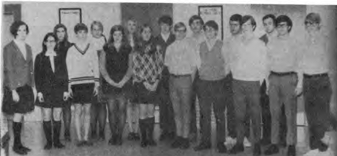
New to John Adams is this Vocal Ensemble. Singers were chosen from the Concert Choir to perform a Madrigal at the recent Music Contest. They will also sing at the State Contest, having received a 8-pt first at District.

Dr. Otis Bowen will be the guest speaker Wednesday, February 18th, at the Brotherhood Assembly sponsored annually by the Eagle Ethics Committee during National Brotherhood Week. Dr. Bowen is presently the Speaker of the House of the state legislature, as he was for the 1967-68 year. He was the Republican Minority Leader of the House for the 1965-66 session and was a candidate for the Republican nomination for governor at the 1968 state convention. Besides being an active member of the House, involved in such important projects as the eradication of TB in Indiana and medical care for the aged and the mentally retarded, he is also concerned with many civic services and organizations. Dr. Bowen resides in Bremen, Indiana with his wife and four children.