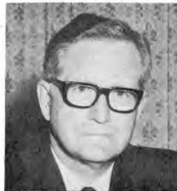
O. R. Bowen, M.D. Speaker of the House

Dr. Otis Bowen will be the guest speaker Wednesday, February 18th, at the Brotherhood Assembly sponsored annually by the Eagle Ethics Committee during National Brotherhood Week. Dr. Bowen is presently the Speaker of the House of the state legislature, as he was for the 1967-68 year. He was the Republican Minority Leader of the House for the 1965-66 session and was a candidate for the Republican nomination for governor at the 1968 state convention. Besides being an active member of the House, involved in such important projects as the eradication of TB in Indiana and medical care for the aged and the mentally retarded, he is also concerned with many civic services and organizations. Dr. Bowen resides in Bremen, Indiana with his wife and four children.