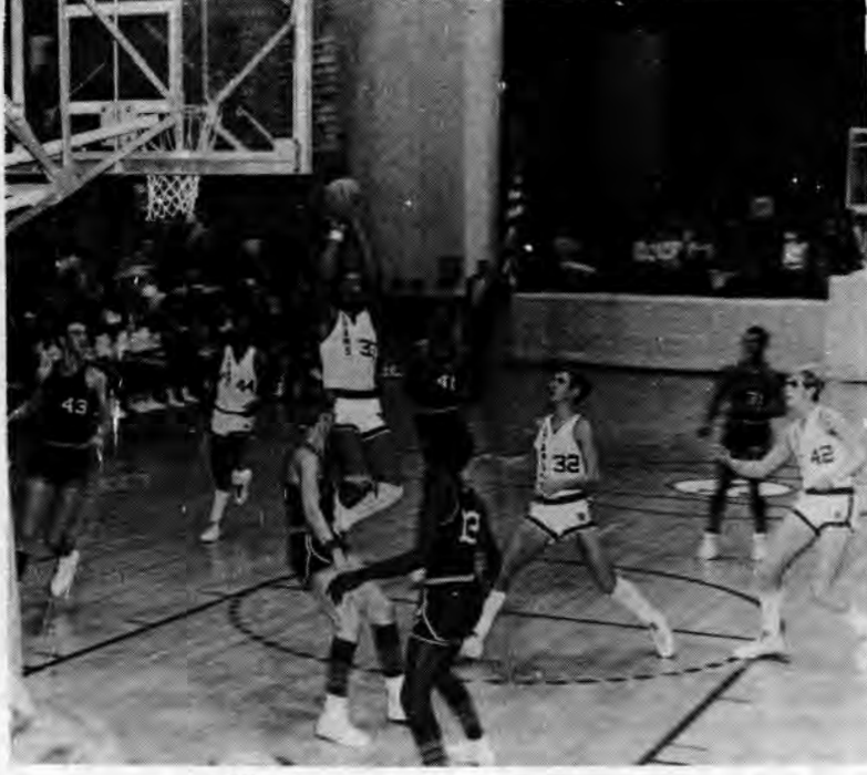
Watch out I'm comin' through!