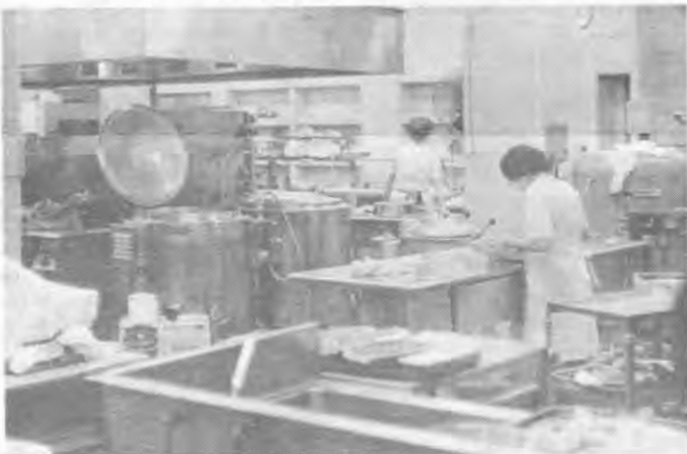
"This is the action behind the scenes as the "cafeteria ladies prepare food for 1,400 people."