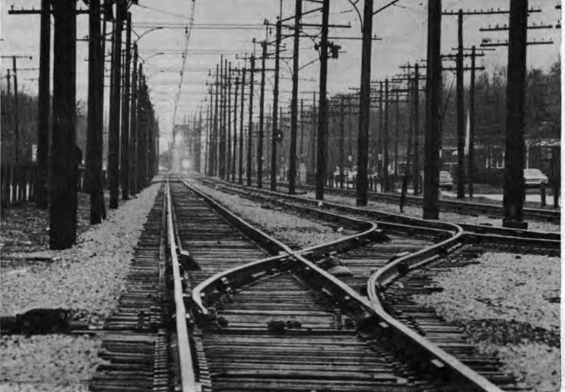
A train approaches the railroad yard in Gary, Ind.

The teacher's survey also included other questions, however they required longer written answers. The important thing to recognize when reviewing this survey is the fact that there are only 23 teachers to base the survey upon. It is too bad that only this number of homeroom teachers found the time to fill out the one page survey. In the representatives survey it can be found that more representatives felt that their homeroom teacher had a lack of interest in Student Council, than those that felt the homeroom teacher had an interest. The enthusiasm of the homeroom acher can have a dramatic effect on the attitudes of not only the homeroom t the representative also.