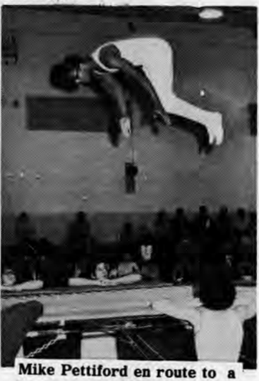
first place on the trampoline.

The matmen have a good chance of taking the sectional title with a performance similar to the one given by all in the NIC meet. The sectional will be held on the Adams mats.