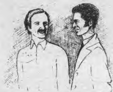
Man, this is turning out to be a real storybook election year. Too bad a few pages are missing.