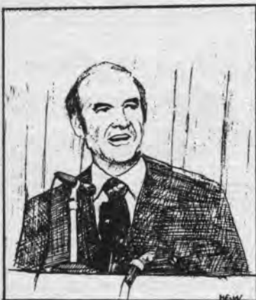
And now, I'd like to re-examine and redefine my position on the firm stand I took in my previous reassessment.