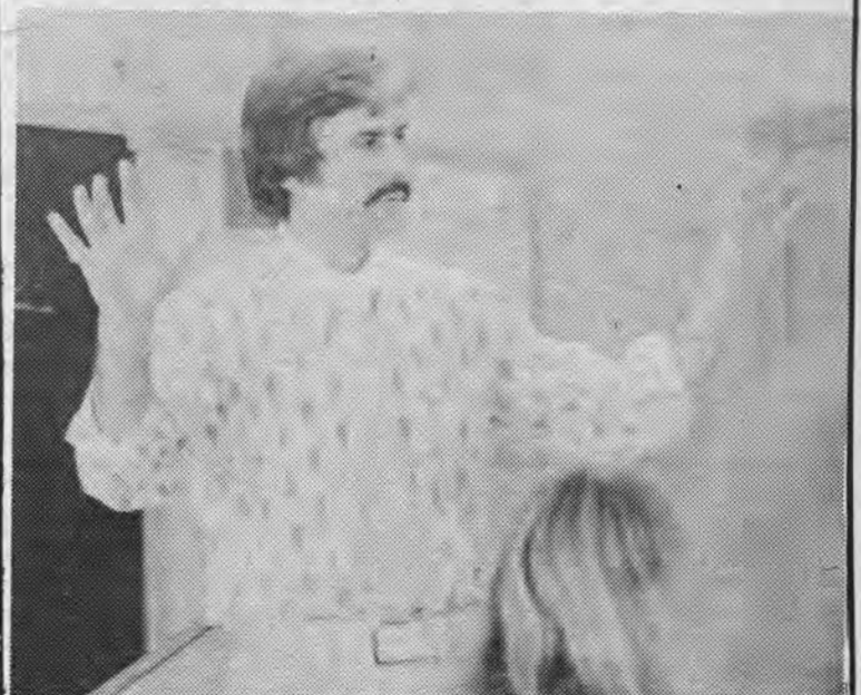
Let me make this perfectly clear