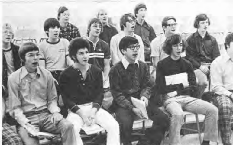
Tenors and basses rehearse for Vespers

Madrigal Singers to perform at Rotary Club December 12. (see article page 3.)