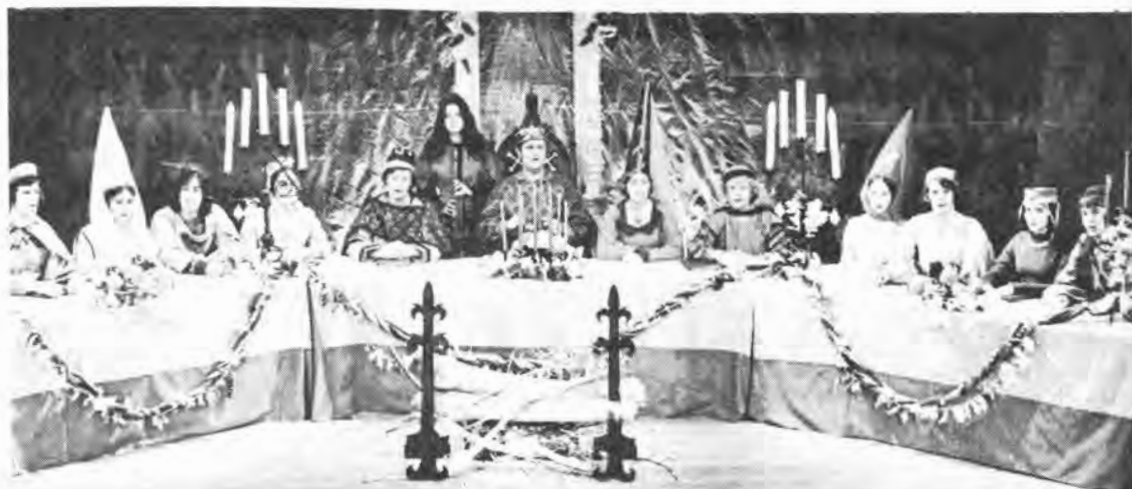
Madrigal Singers at their Banquet Table

Enthusiastic applause is the Madrigal Singers' only reward; they aren't paid. But their colorful, excellent performance will receive an encore in December 12 and 17 shows at the Rotary Club and Scottish Rite. At least they get free banquets - and well-pleased audiences.