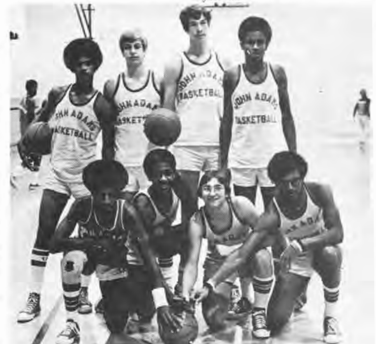
The "Healthy" 8 prepare for Northrup Tower

Always in the thick of torrid NIC competition, and spiced with plenty of out-of-town action; this year's schedule measures up to be another exciting year of Hoosier Hysteria.