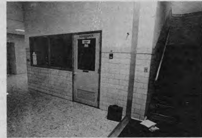
Underground pornography is published in TOWER office [left]