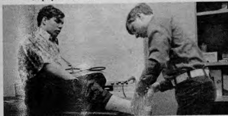
Managers show their skills

Adams played Jackson and the score was Adams 36 Jackson 26. This was their first victory and lifts them out of last place. The freshmen still have a pretty big schedule left in their season so let's get out there and watch them the rest of the season.