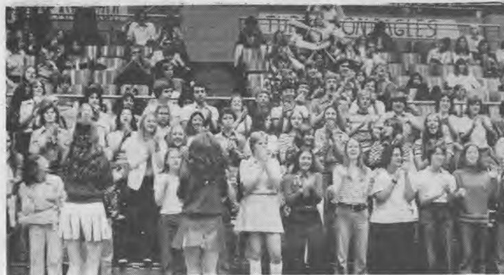
HIGH SPIRITS -- The Junior Class was picked as best voices of the week.