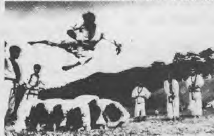
Kim is executing flying kick