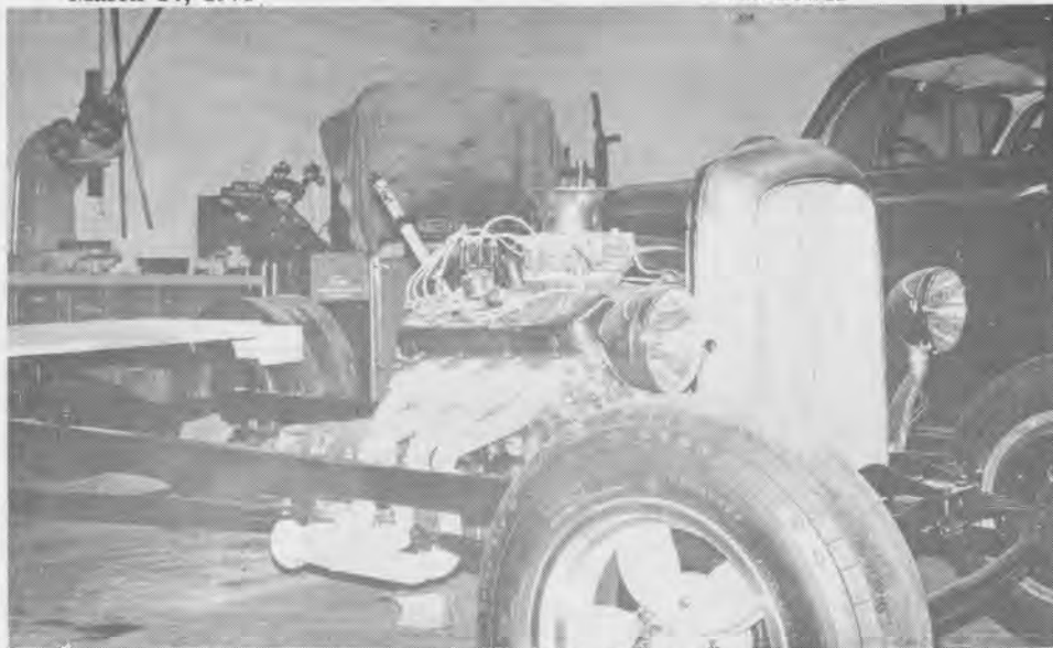
Street car? Mr. William's Vocational III and IV class transforms a frame into a Coca-Cola truck.