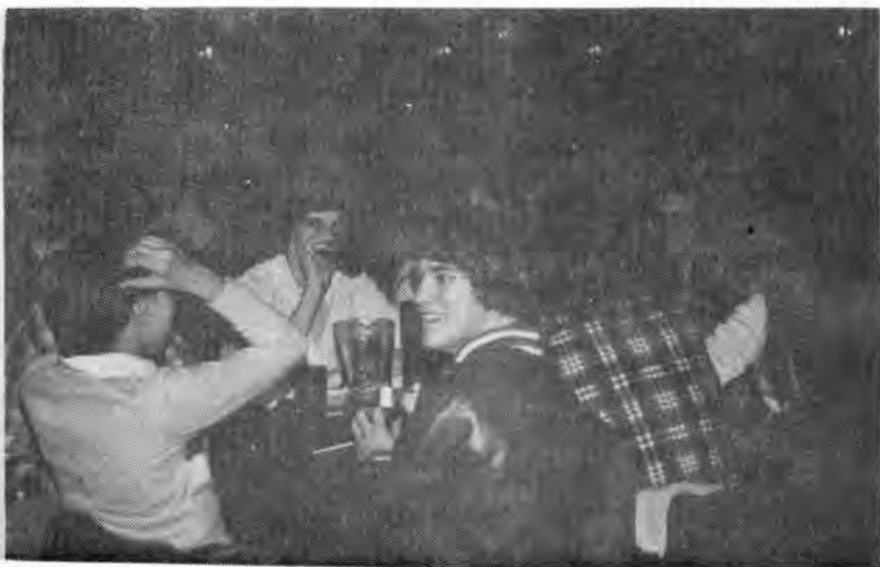
Sophomores enjoy their post-game plunder