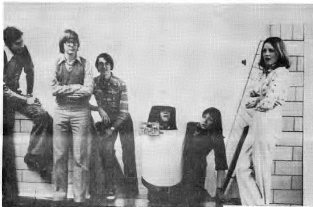
Creative loitering brings out hidden talents.