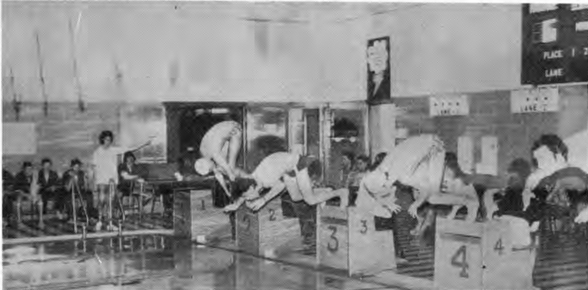
Seagles sprint off starting blocks during a recent meet.

The next girl's home gymnastics meet will be Tuesday, February 10 against '75 state champs, Portage.