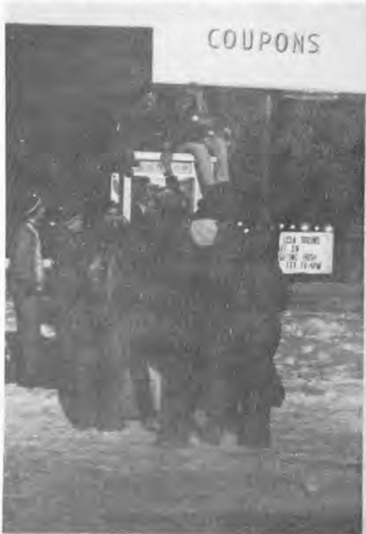
"O.K., who's got the dime?"