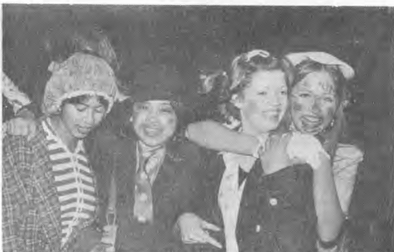
Sorority sisters exhibit poise and grace.