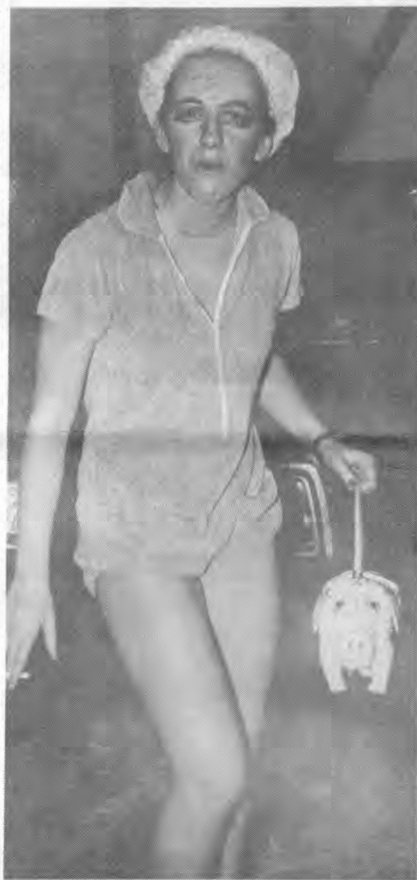
Formal attire is found in any crowd.