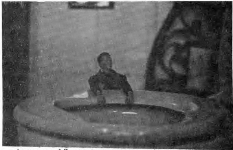
Anyone can fall prey to nausea after gouging themselves.