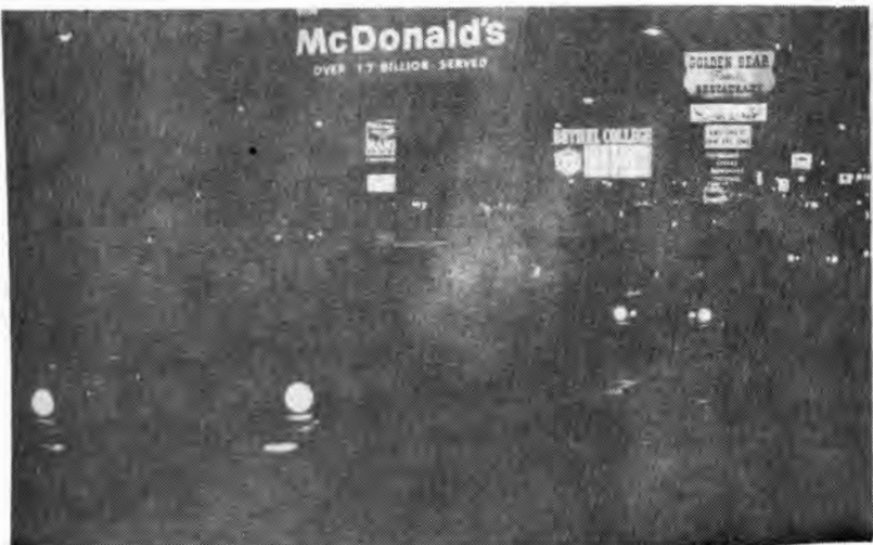
A typical hot spot.