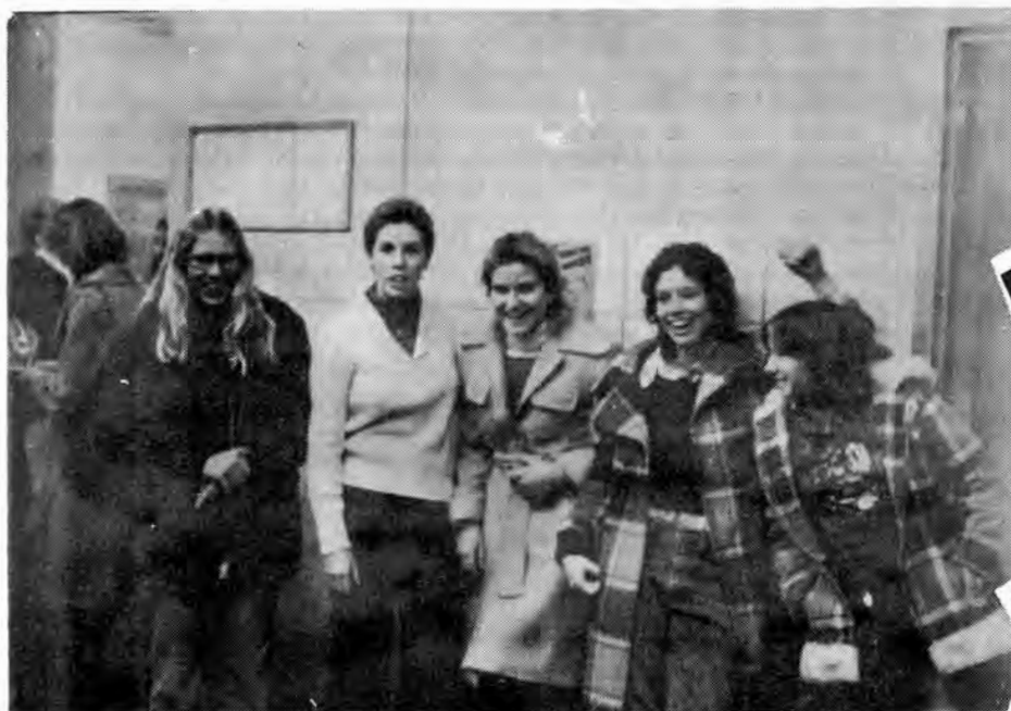
Some of our girl's swim team state qualifiers display their picture-posing talents.....