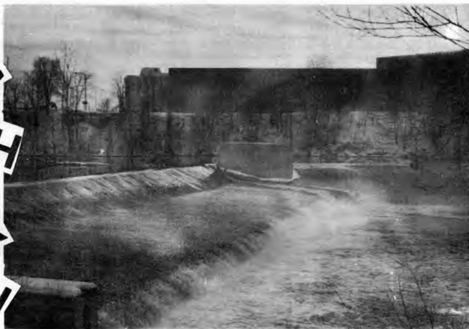
Mist on the St. Joe river dam provides a mysterious atmosphere....