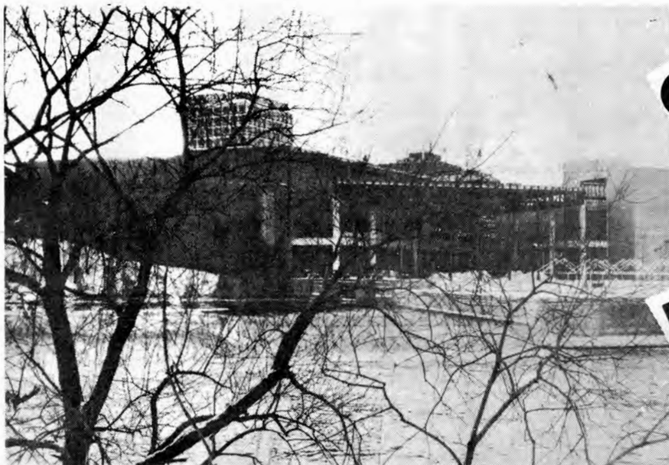
A view of the Century Center from across the river portrays the beauty of a changing city.