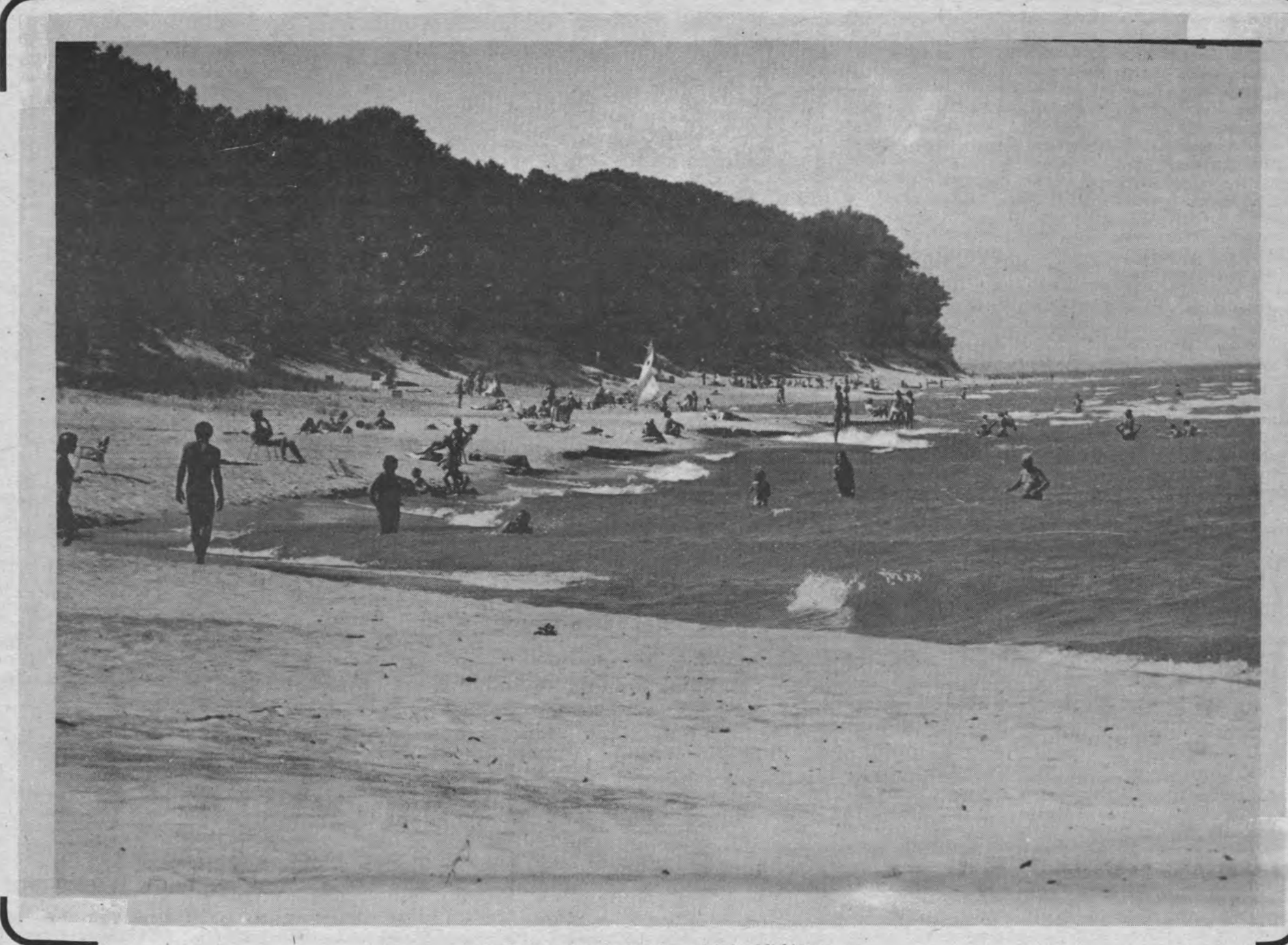
Sunbathers hit the beaches of Lake Michigan.