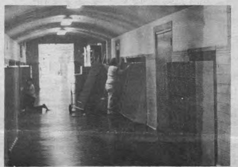
New lockers come in as the old ones go out.

Various other repairs have help to brighten up the building been made or have been planned and make it more pleasant for for the near future. Among these everyone. In addition to the improvements are new doors at locker replacement, the building some of the entrances to the will be plastered and painted building and a new clock system to replace the somewhat less Of special interest to art than accurate one currently students will be the extensive installed. With these and other work which has gone on in the improvements in the building, Art Department. Students will life at John Adams should be made a bit easier for all.