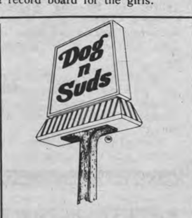
State Rd. 23 & Edison Rd. Phone 277-4750

Nov. 17 Elkhart Memorial 7:00 Note: The team will be having Swimathon on Saturday, September 17 from 9 to 11 at the Admas swimming pool. The Swimathon is to raise money for a record board for the girls.