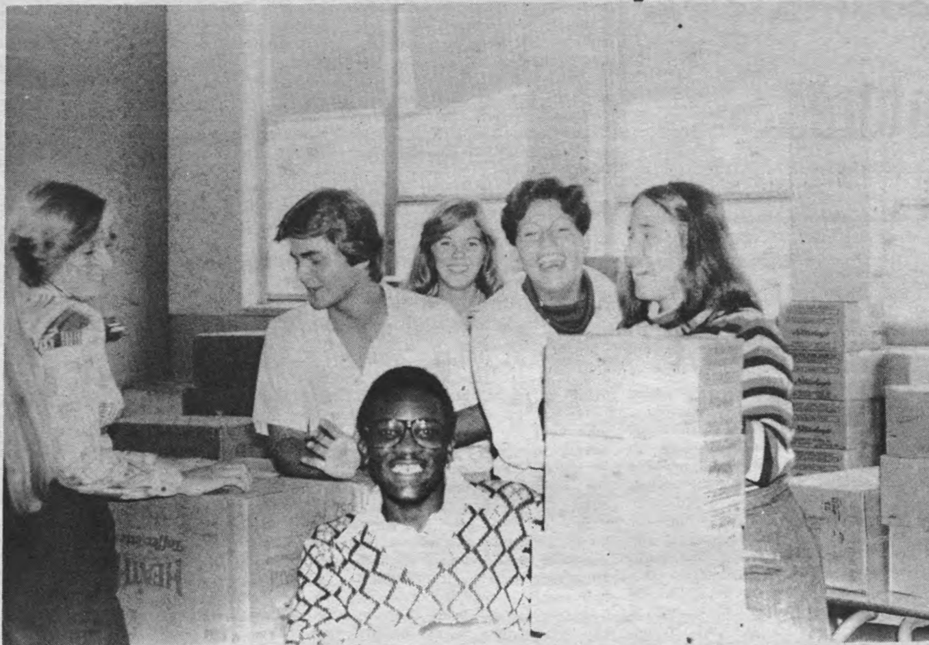
Is it a Teeth Horror Movie? Are the Juniors smiling at their candy sale accomplishment?