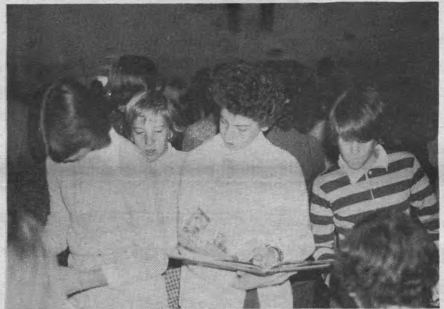
Freshmen explore at the Club Fair.