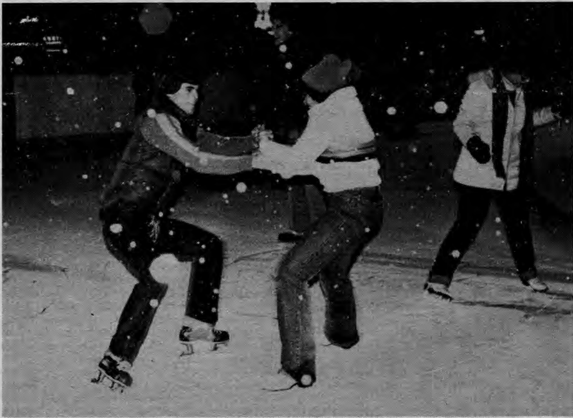
Who's holding up whom? Seniors demonstrate the ONLY way to skate.