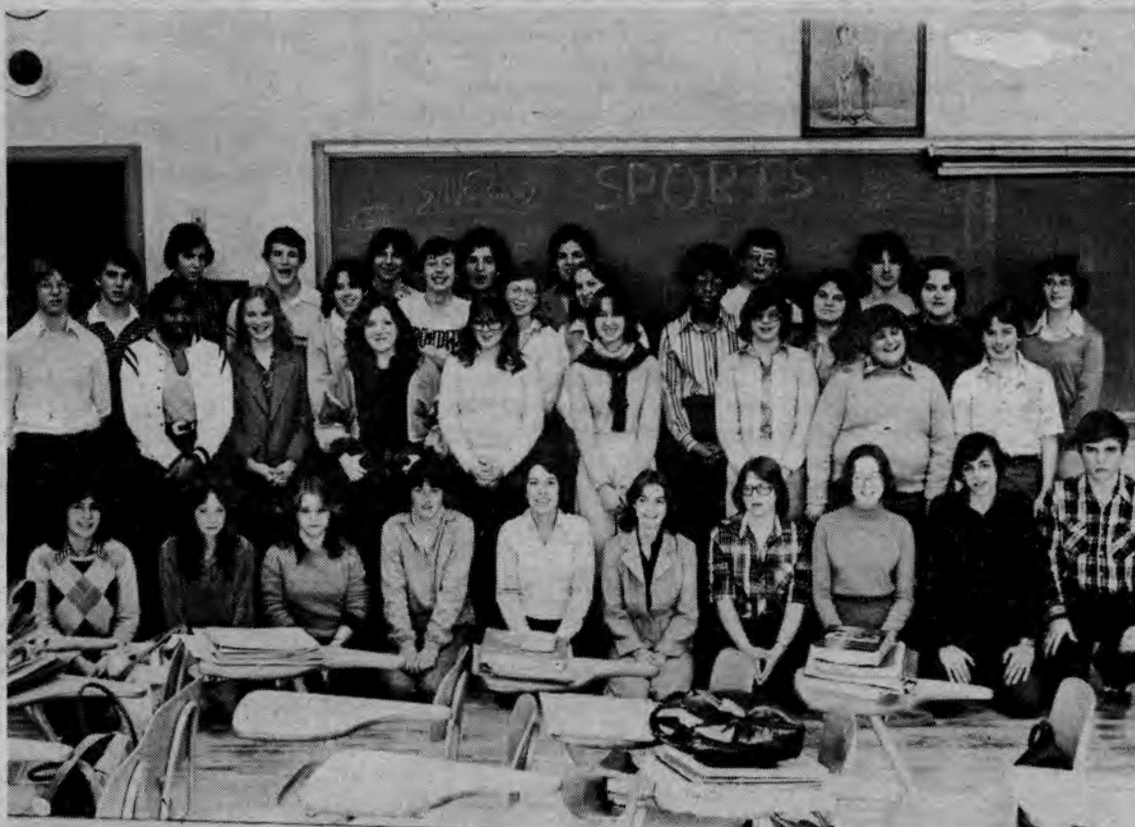
The new TOWER staff gathers for the first in a long series of planning meetings for the 1979-80 TOWER.