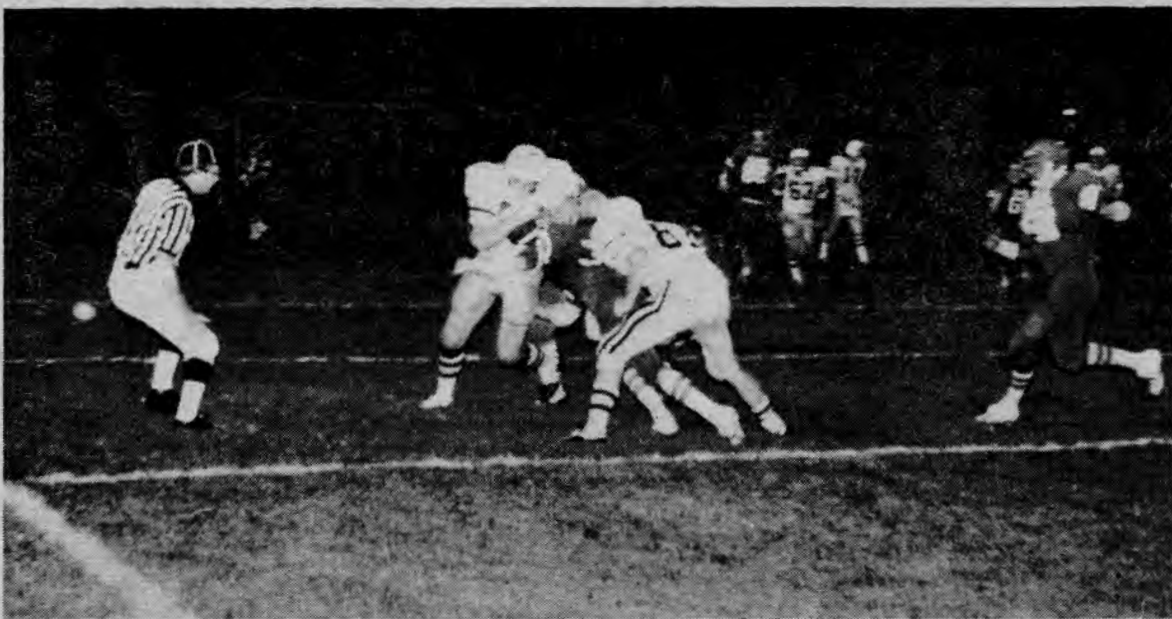
Eagle defense puts the club to Mishawaka.

The Eagles look to halt their dismal losing streak against Washington next week. Come out and help support the Eagles.