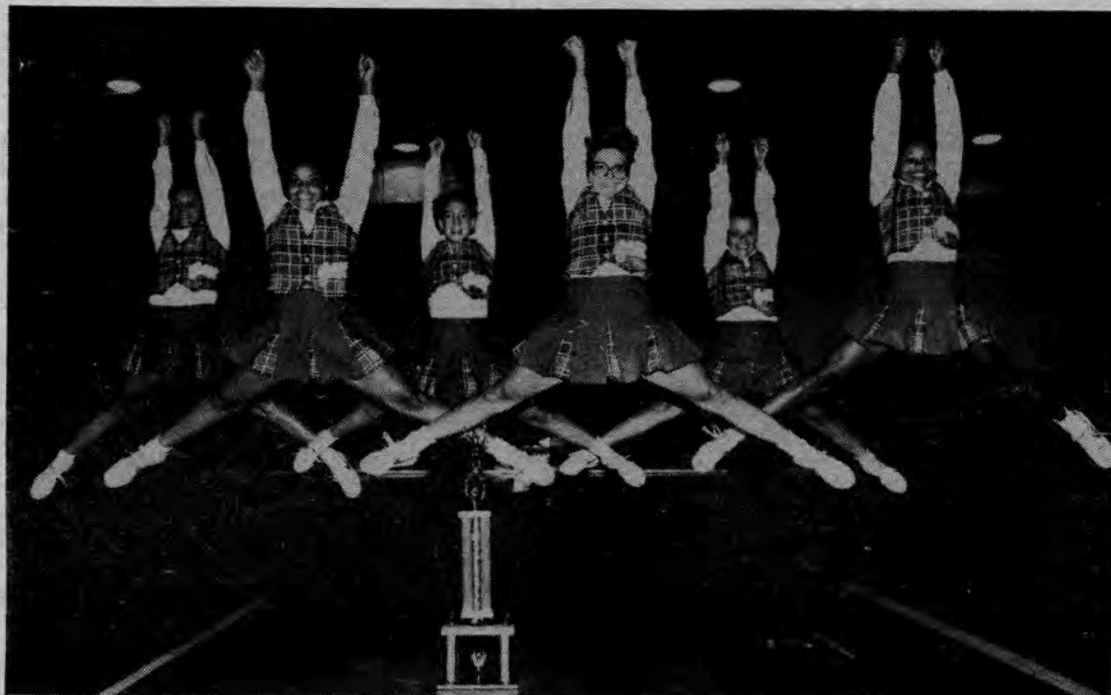
Are the cheerleaders suspended from the ceiling or is their formation really that good?

The Varsity's routine lasted for of four minutes. All the long early morning practices paid off for a first place trophy awarded to the girls who were one of 17 squads. Both teams were judged on appearance, originality, execution, difficulty, as well as other areas. Each team felt well supported and would like to thank the fans who were present.