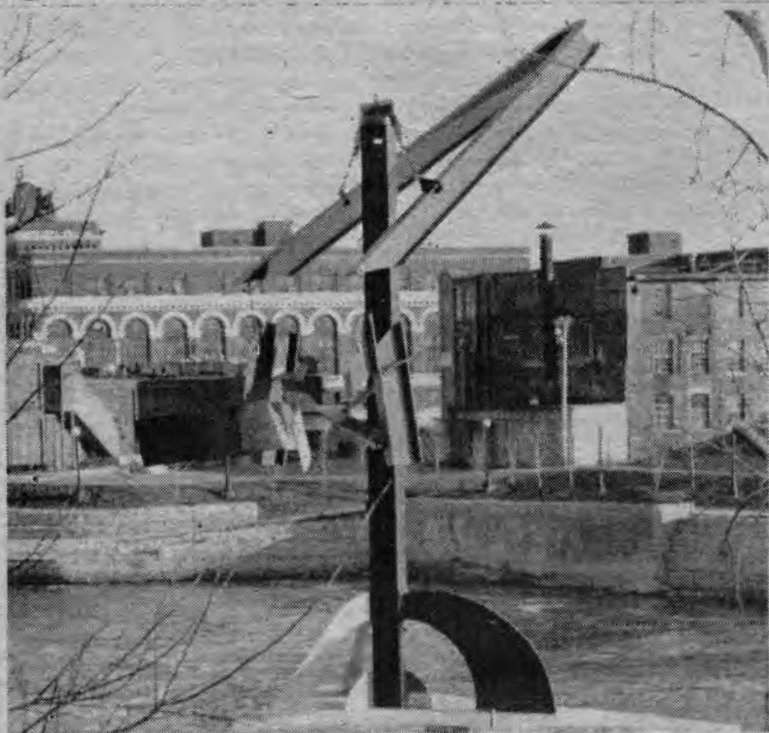
Di Suvero sculpture, a controversial piece of art, sits on the St. Joe River.