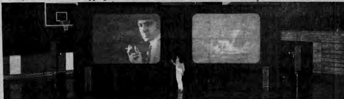
Screen display livens dance assembly

Most students agreed that it was better than fifth hour whether they liked the show or not. But the assembly proved that it is possible to gather all the students from one school into one room for educational purposes without protest. The discipline response of the students was encouraging to the administration promoting the possibility for future assemblies.