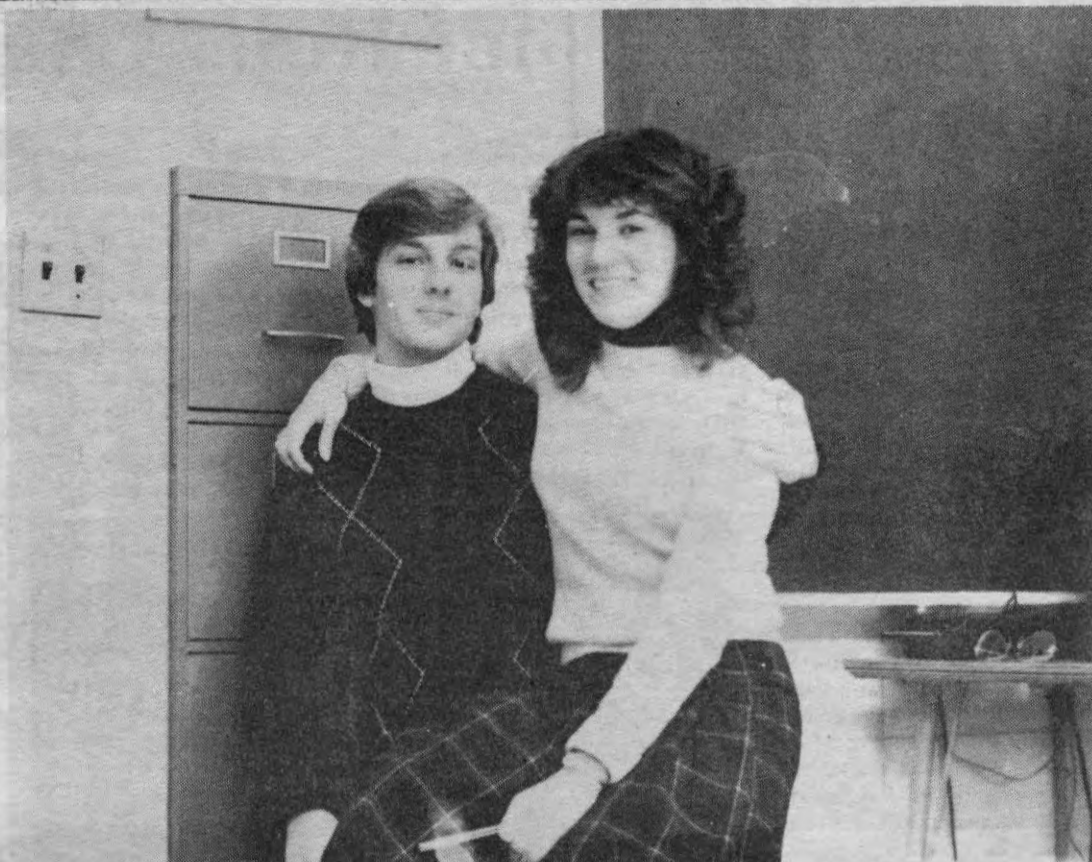
Note: These are only models, not true preppies!

The final hope? Go out and buy yourself a pair of Wrangler's.