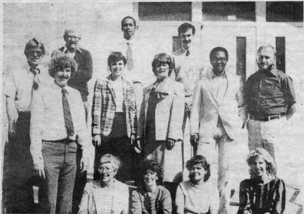
The Tower welcomes the new faculty members.