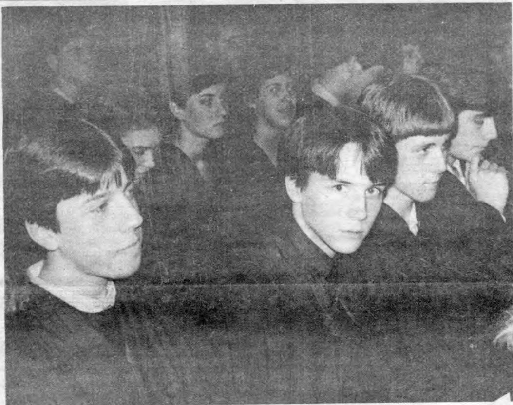
New National Honor Society inductees prepare to take the NHS pledge.