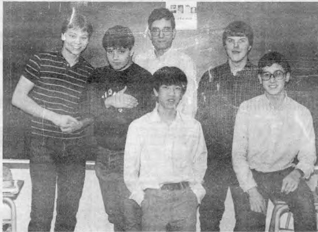
Those "incrediburgable" members of Zero Gravity Productions are "raffiling" off an evening of rapture as first prize.