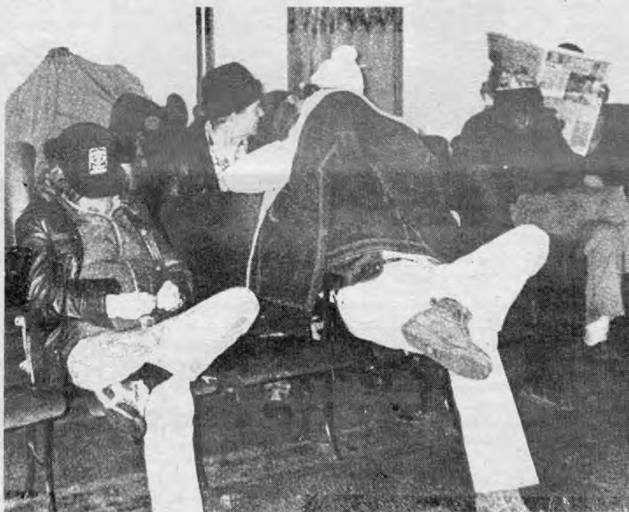
Victims of poverty find comfort and a roof over their heads at the Hope Rescue Mission.