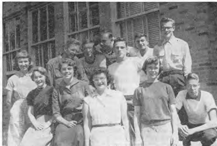
The cast for "Polly with a Past" is shown above. The curtain will rise at 8 tonight.