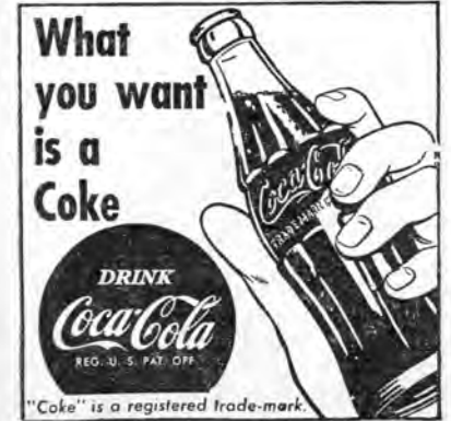
THE COCA-COLA BOTTLING CO. OF SOUTH BEND