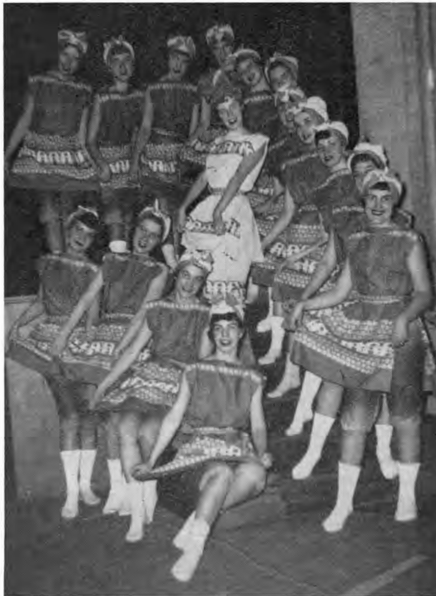
Pictured above is one of the many choruses featured in "Hi Jinks" which will be staged in the Adams Auditorium April 8 and 9.

The Student Council announced that the Korean War Orphan collection amounted to approximately $510. Details of the three-week drive will be given in The TOWER next week.