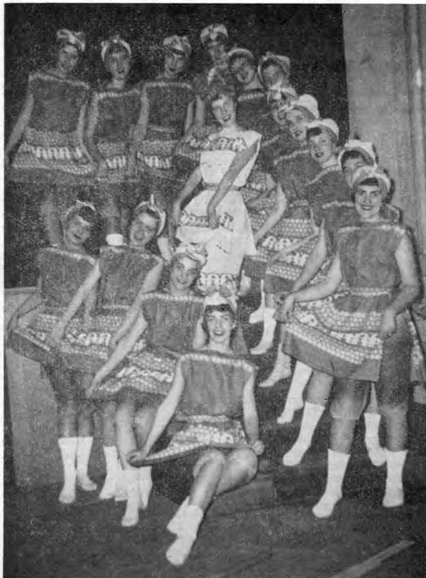
"Hi Jinks" — A Huge Success