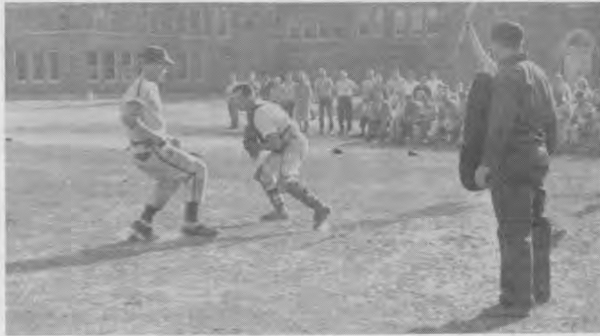
Paul Edgerton scores one of the 8 runs in Adams' 9th defeat of Central. Borges is shown catching for Central.

Adams' Eagles continued their mastery over Central by downing the Bears 8-3. Adams collected 8 runs on ten hits in their ninth straight defeat of Central. Central scored 3 runs on six hits. Adams collected their runs off pitchers Cieslik and Zielinski.