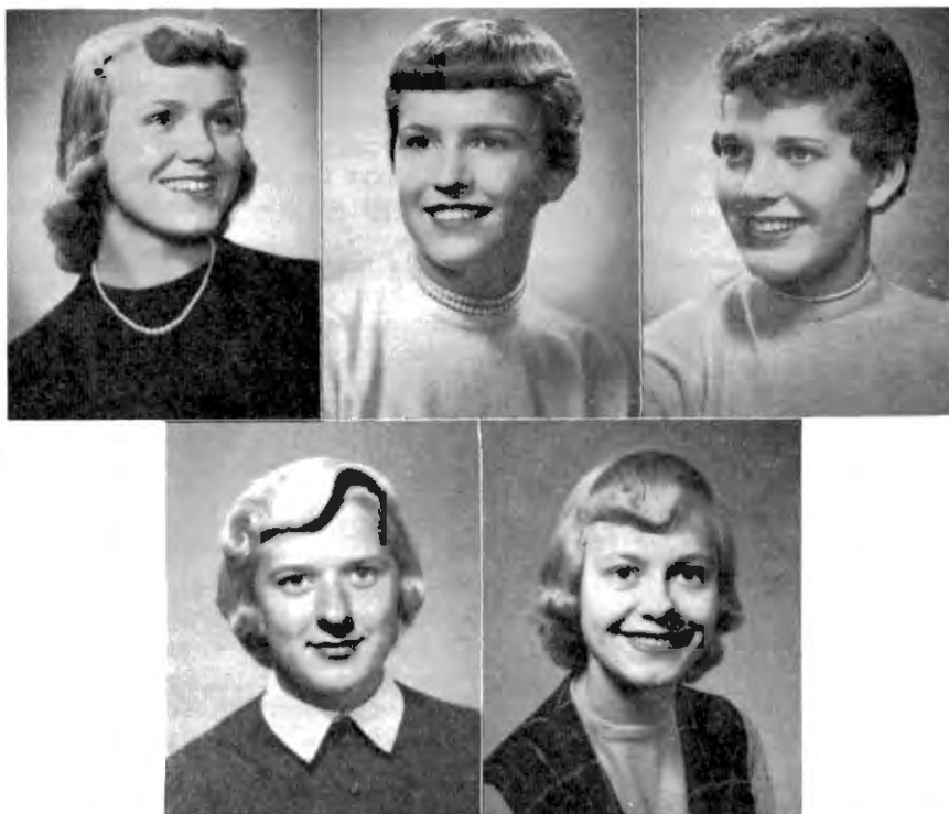
WHICH ONE OF THE PRETTY CANDIDATES will reign as Queen of the Adams vs. Riley game, January 26?