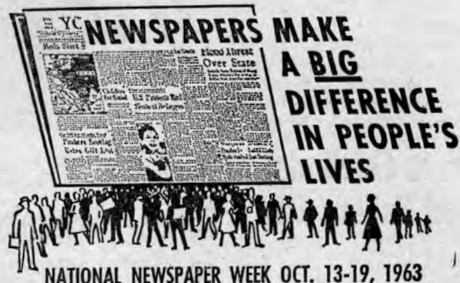
NATIONAL NEWSPAPER WEEK OCT. 13-19, 1963

Published every Friday from September to June except during holiday seasons by the students of the John Adams High School, 808 South Twyckenham Drive, South Bend, Indiana 46615. Telephone: AT 8-4635. Price: $2.00 per year.