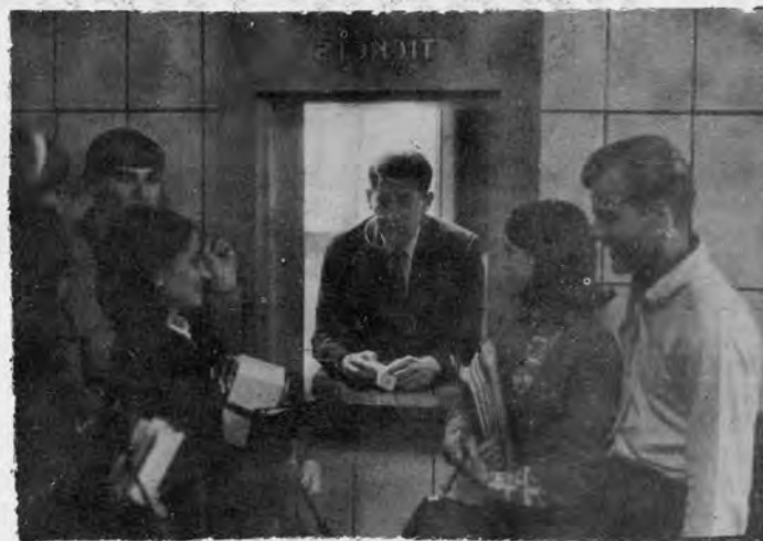
Who has whom behind the ticket window!