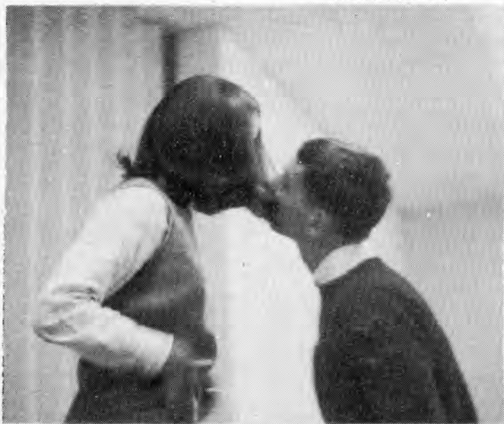
The Tower's eyes are everywhere!

Wilt's Quality Foods Serving you is our pleasure 1326 N. Ironwood South Bend