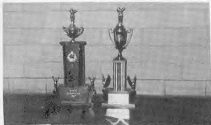
A couple of the trophies won by the John Adams swim team.

As the Adams swim team opened their 1967-68 season, there was a feeling of uncertainty. Everyone thought this year's team would not be quite as good as last years, yet everyone was fairly certain they would win all of their dual meets and most likely the state title. Two members of the state champion freestyle relay team and state champion had graduated and last year's team depth was gone. However, the Seagles losing a meet is simply inconceivable.