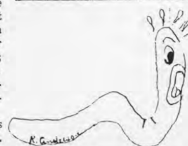
Another grading period down.

"Antigone", a counterpart of "Oedipus Rex", was written by a Frenchman, Jean Anouilh.