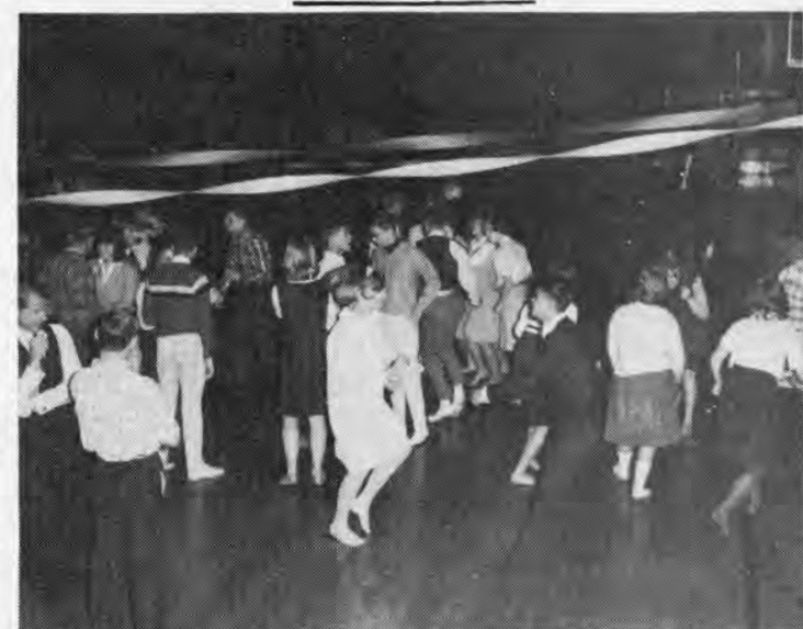
Can you recognize anyone at the Sophomore dance, "The Eve of Destruction."