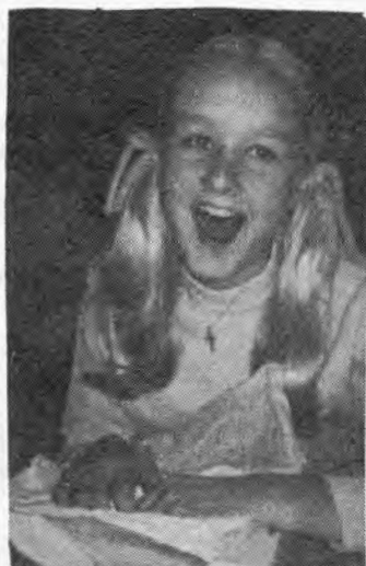
Wow, It must be funny!