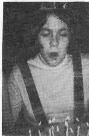
Take a deep breath and make a big wish!