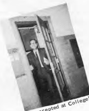
"I've been accepted at College!"