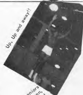
Up, Up and away!!