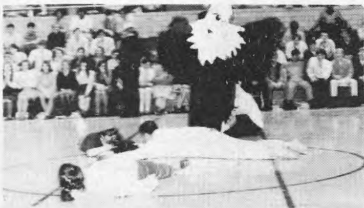
AN ELATED EAGLE watches The Clod Squad go down at the hands of Adamsites. This scene took place at the pep assembly for the first Sectional game with Mishawaka.

Tickets will be sold until Friday at four, Four Corners. If a student wishes to attend only the games, tickets may be had for $.50 at the door.