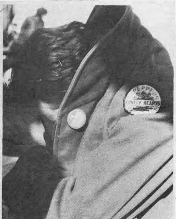
Tears are rolling from this young man's eyes as he remembers things about his brother who recently lost his life in Viet Nam.