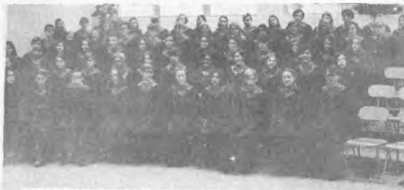
The Concert Choir takes a minute from rehearsal to pose for a picture.