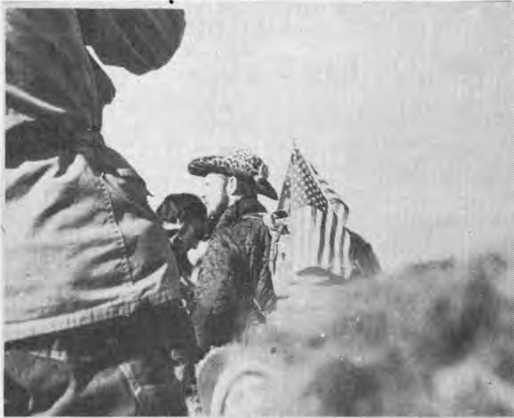
THE PATRIOT -This draft age young man is showing that he is still for America even though she makes a few mistakes every now and then that he cannot condone.