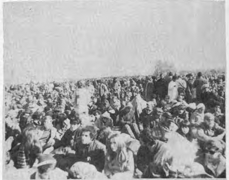
People trying to keep the cold from getting in at the rally on the Washington Monument grounds. The Monument can be seen in the background.

Then came the "March On Washington" down Pennsylvania Avenue to the Washington Monument for a rally. Hecklers and trouble makers were handled very well by police. The Rally: Tim Leary looked out over the crowd and explained the situation, "Take one Woodstocks, take three Woodstocks. Out of sight. Out of sight." A song came on "If I were free, to speak my mind." Leary was leading it. After the song Leary, who had been quite excited, calmed down a bit. An announcer said something about a million five hundred...and the screams were so intense that whatever he said after could not be heard. Peter and Mary (of Peter, Paul, and Mary) broke into If I Had A Hammer , and everyone sang along. Then came Cast of Hair . Someone over